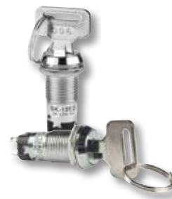
Changes for SK Keylocks

I. There will be several changes for the low and medium security SK switches. "Japan" will no longer be displayed on the switch case, the older logo will be replaced with the updated NKK logo, the lot number on the switch case will have a dot mark above the second digit, and the box in which the switches are packaged for shipping will read "PHILIPPINES FACTORY" instead of "JAPAN FACTORY." All of these revisions will apply to standard, custom and UL/CSA approved products. Effected standard part numbers for SK are on the table below.