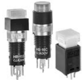
Production Revisions for HB & HB2 Series

1. There will be production changes for HB illuminated switches and indicators and HB2 illuminated switches. The logo will be updated, and the lot number on the switches will have a dot mark above the second digit. The box in which the switches are packaged for shipping will read "PHILIPPINES FACTORY" instead of "JAPAN FACTORY." All of these modifications will apply to standard, custom and approved devices for both series. The standard part numbers are on page 2.