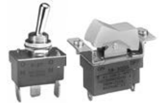
Changes for S Toggles & SW Rockers