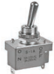
Changes for S Toggles

2. S Toggles with UL approval, both standard and custom, will have a change to the UL factory code. The table below illustrates the modification, followed by the effected part numbers.