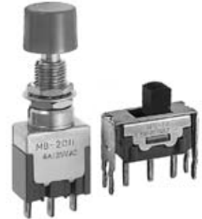
Changes for MB Pushbuttons & MS Slides, Among Other Series

The location of production will change for EB and MB Pushbuttons, and CS and MS Slides from the China factory to the Philippines factory. The lot number on the side of the switch cases will have a dot mark above the second digit instead of the first digit. The box in which the switches are packed for shipping will now read "PHILIPPINES FACTORY" instead of "CHINA FACTORY." All of these modifications will apply to custom as well as standard products.